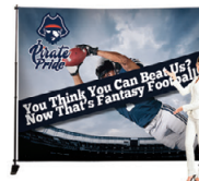
Large Adjustable Displays