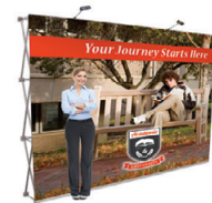
Quick Fabric Displays

Attract More Attention and Showcase Your Message!