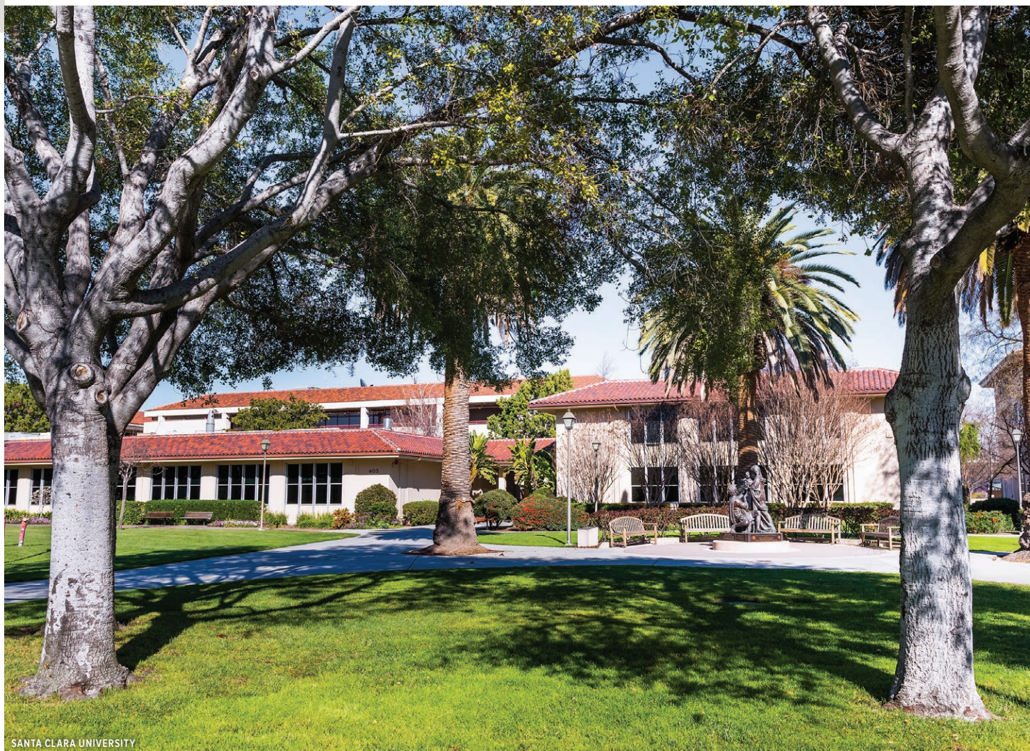
SANTA CLARA UNIVERSITY

Both institutions have embraced the benefits of RLCs, not merely by creating a culture of support and collaboration, but by making these spaces comfortable, stylish, and amenable to the technological needs of students and faculty alike.