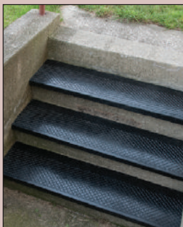
Outdoor Rubber Stair Treads