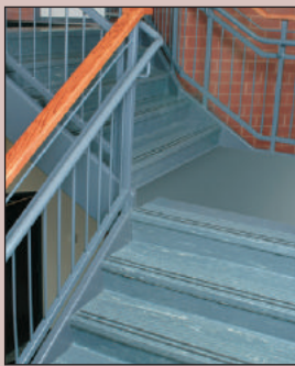
Rubber & Vinyl Stair Treads