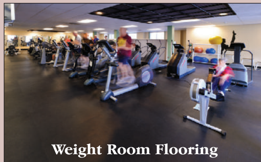
Weight Room Flooring