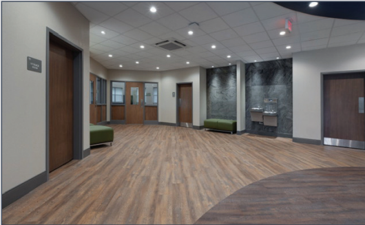
HALLS &amp; CORRIDORS