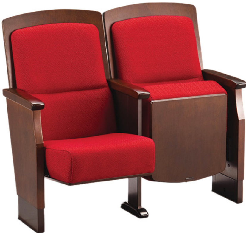
TS-15 Model Chair

The ideal public space for KOTOBUKI SEATING is one that everyone can enjoy, is safe and will last for generations.