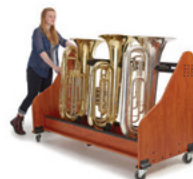
Tuba/Sousaphone Mobile Storage