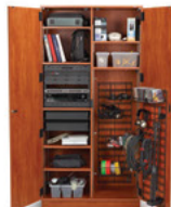
Fixed and Mobile Media Storage