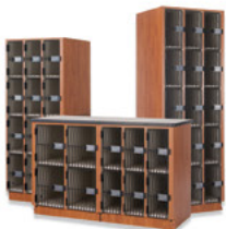
UltraStor® Storage Cabinets