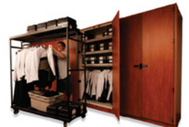
Fixed and Mobile Garment Storage