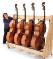
Stringed Instrument Mobile Storage