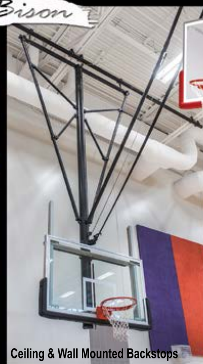
Ceiling & Wall Mounted Backstops