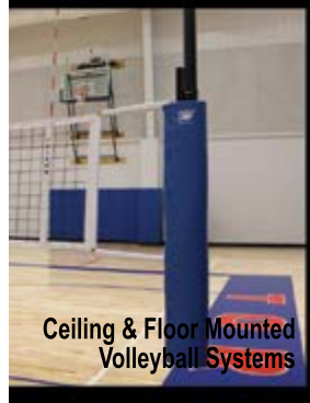
Ceiling & Floor Mounted Volleyball Systems