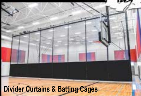
Divider Curtains & Batting Cages

IPI by Bison projects include quality Bison sports equipment!